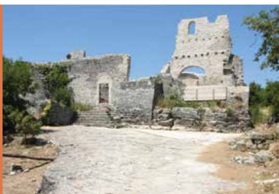
Ruins of the medieval city of Dvigrad

Dvigrad is an abandoned medieval town with the remains of about 180 houses, well-preserved city walls with three defensive towers and three gates. Its impressive ruins and unspoilt landscape dotted with numerous sacred buildings and archaeological sites have made Dvigrad an attractive tourist location. It is planned to rehabilitate Dvigrad as a multidisciplinary on-site research and educational centre envisioned for future heritage experts.