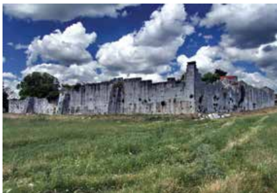
Jusuf Mašković's Inn, Vrana

The caravanserai, set in beautiful landscape, is the most significant Ottoman civil monument in Croatia. Following successful application for EU-IPA funds, the han is being converted into a multi-purpose complex with a restaurant, shop for local products, the offices and info point of the Vrana Lake Nature Park and an exhibition space connected with the nearby Templar castle ruin. The project involved the exchange of regional experts specialized in Ottoman architecture. The project has much expected social and tourism impacts.