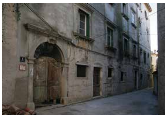
Moise Palace, Cres, Island of Cres

Dvigrad is an abandoned medieval town with the remains of about 180 houses, well-preserved city walls with three defensive towers and three gates. Its impressive ruins and unspoilt landscape dotted with numerous sacred buildings and archaeological sites have made Dvigrad an attractive tourist location. It is planned to rehabilitate Dvigrad as a multidisciplinary on-site research and educational centre envisioned for future heritage experts.